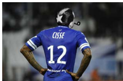
12. Nøne Futbol Club, Work n°2B : La tonsure (after Marcel Duchamp), 2015 Collage, 21 x 29,7 cm