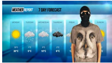
14. Hito Steyerl , Liquidity Inc. , 2014 (still) HD video file, single channel in architectural environment 30 minutes, Edition of 7, with 2 APs Image CC 4.0 Hito Steyerl Courtesy of the Artist and Andrew Kreps Gallery, New York