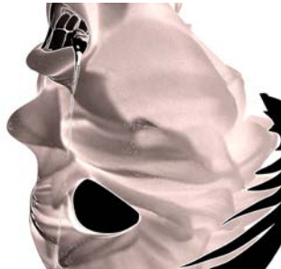
7. David Douard, The reason we no longer s'peak, slippers of snow , 2015 Capture d'une animation 3D. Courtesy de l'artiste et Galerie Chantal Crousel, Paris. © David Douard