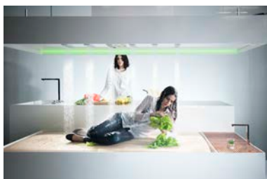
1. DIS , The Island (KEN) , 2015 Created in collaboration with Dornbracht and co-designed by Mike Meiré

The visuals provided are subject to Intellectual Property Rights legislation. Provision of visuals in no way constitutes an assignment of rights or permission to reproduce, which must be requested and obtained directly from the artists or their beneficiaries. The publisher of the content takes full responsibility for the use he makes of the said visuals.