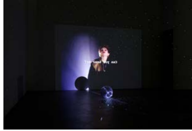
6. Trisha Baga, Madonna y el Niño , 2011 Installation view, World Peace, Kunstverein Munchen, Munich, 2012, DVD and disco ball, 25:14 minutes, Photograph: U. Gebert - Courtesy of the Artist, Kunstverein Munchen, Munich and Greene Naftali, New York