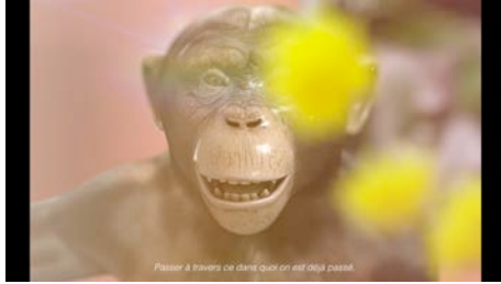
5. Ed Atkins, Even Pricks , 2013 HD video with 5.1 surround sound, 8 minutes, Courtesy the Artist, Cabinet London and Galerie Isabella Bortolozzi, Berlin