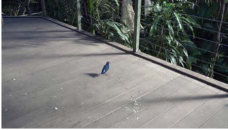
13. Rachel Rose , Still from Sitting Feeding Sleeping , 2013 HD Video, 9 minutes and 49 seconds