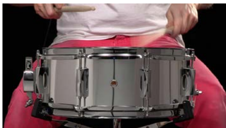
11. Mark Leckey, Pearl vision , 2012 Quicktime video, 3 minutes 6 seconds Courtesy Mark Leckey and Cabinet, London