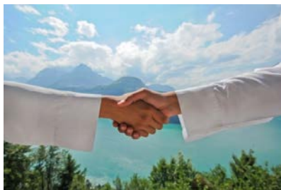
9. GCC, Inaugural Summit, Morschach 2013 1, 2013 digital c-print, 70 x 103 cm