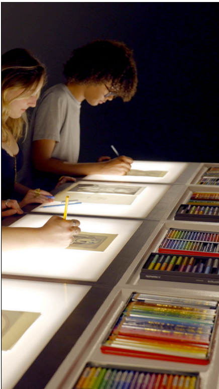
Drawing collection workshops for the exhibition "Reanimation Paintings: A Thousand Voices" 2024

There is an immediate sensory stimulation in seeing the imaginations of thousands of children flash before your eyes. But behind the drawings are both individual and universal stories [...]" Oliver Beer, 2023