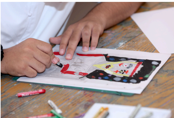
Workshop with children in Abu Dhabi for the production of "Reanimation Painting (Portrait of Fayoum)" 2019