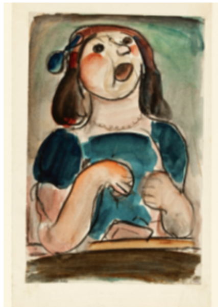
Georges ROUAULT (1871 - 1958) Buste de chanteuse de face, 1902-1914 Oil diluted with petrol, charcoal and watercolour on paper 31.2 x 20.5 cm MAM Paris collection