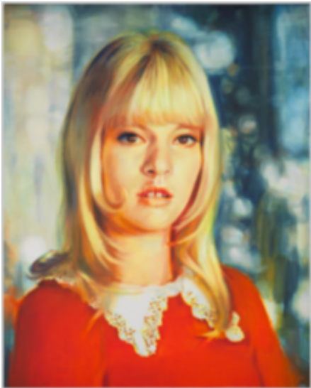
Nina CHILDRESS (1961-) Sylvie (grosse tête) , 2018 Oil on canvas 250 x 200 cm MAM Paris collection © Paris Musées / Musée d'Art Moderne de Paris / AGDP 2024