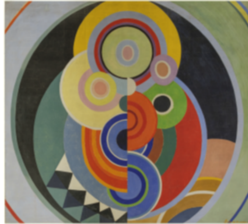
Sonia DELAUNAY (1885 - 1979) Rythme, 1938 Oil on canvas 536 x 595 cm MAM Paris collection