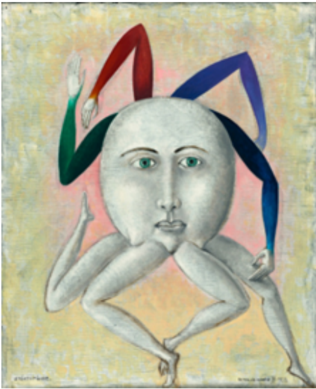
Victor BRAUNER (1903-1966) Stéréofigure, 1959 Oil on canvas 73 x 60 cm MAM Paris collection